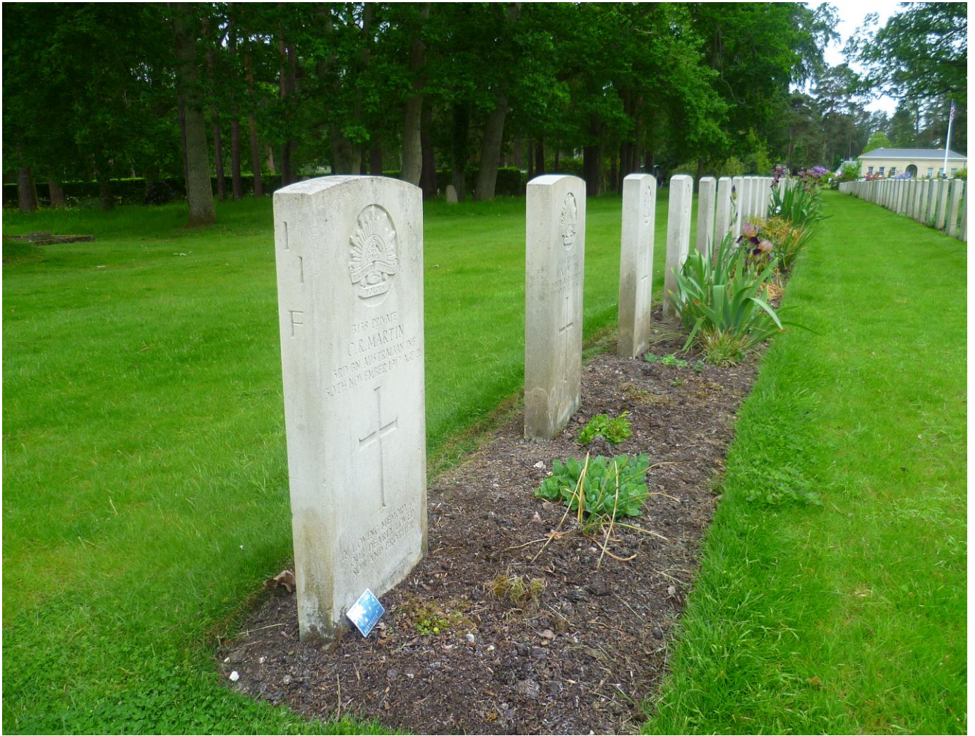
Plot 11 Row F – Brookwood Military Cemetery (Photo courtesy of Ian Fletcher – June 2021)